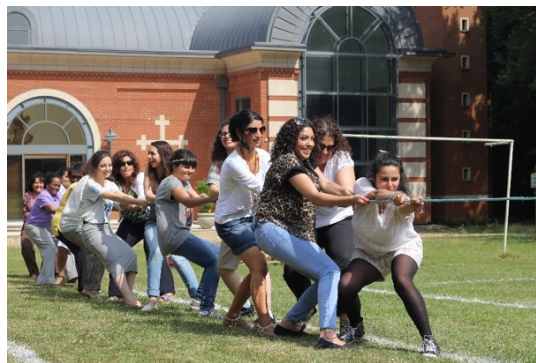
Coptic Church Youth Mission: Tug-of-War

For further information or to make a donation please contact administrator@standrewbythewardrobe.org www.standrewbythewardrobe.org.uk