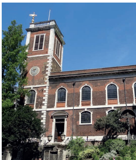
St Andrew by the Wardrobe